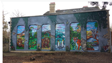
Palace Road Nature Garden Palace Road SW2 3EG