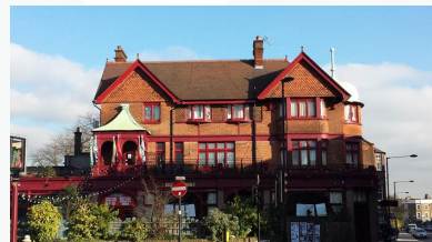
Hootananny 95 Effra Road, SW2 1DF