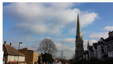
Holy Trinity & St Matthias Church Trinity Rise, SW2 2QP