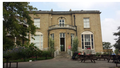
Brockwell Hall Brockwell Park